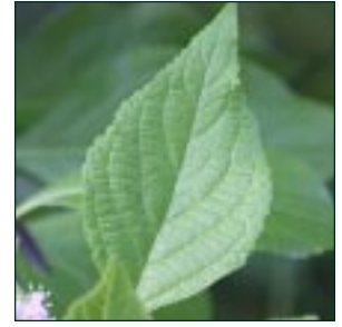
Callicarpa americana – American Beautyberry native • tall shrub • mint family bee attractor • berries eaten by birds (especially Mockingbirds)