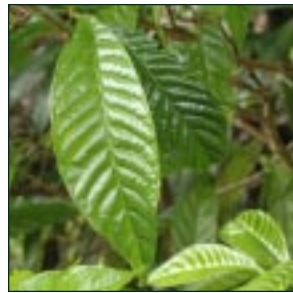
Psychotria nervosa – Wild Coffee native • medium shrub • madder family butterfly and bird attractor larval plant for Tersa Sphinx moth