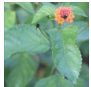
Lantana camara – Lantana not native • small shrub • verbena family butterfly attractor • flower colors vary widely leaves toxic to grazing livestock and dogs unripe fruit fatal to humans if eaten