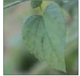
Salvia coccinea – Tropical Sage native • wildflower • mint family hummingbird and butterfly attractor larval plant for Hermit Sphinx moth