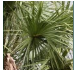
Sabal palmetto – Cabbage Palm native • tree • palm family aromatic bloom stalks attract pollinators mammals and birds eat fruit

For more information on these and more Florida plants that attract butterflies and other wildlife, please refer to any of the following. Print publications are available in the Corkscrew Nature Store.