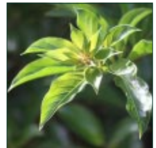
Hamelia patens – Firebush native • tall shrub • madder family hummingbird & butterfly attractor • birds eat fruit buds yellow–blooms orange turning red after pollination