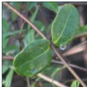
Lonicera sempervirens – Coral Honeysuckle native • climbing vine • honeysuckle family hummingbird & butterfly attractor • birds eat fruit