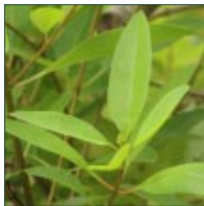
Galphimia gracilis – Slender Goldshower not native • small shrub • barbados cherry family fruit eaten by birds and mammals petals fall as fruit ripens