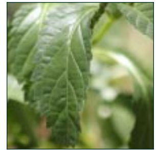
Stachytarpheta jamaicensis – Blue Porterweed native • low growing perennial • verbena family nectar source