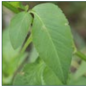
Bidens alba – Spanish Needles native • wildflower • aster family nectar source