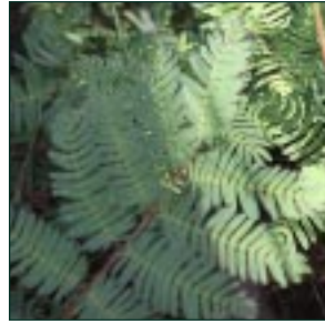
Mimosa strigillosa – Sunshine Mimosa native • ground cover • pea family bee attractor • larval plant for Little Sphinx moth