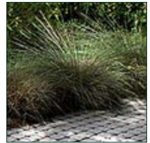
Stachytarpheta jamaicensis – Muhli Grass native • grass • grass family purple flowers in fall • provides cover