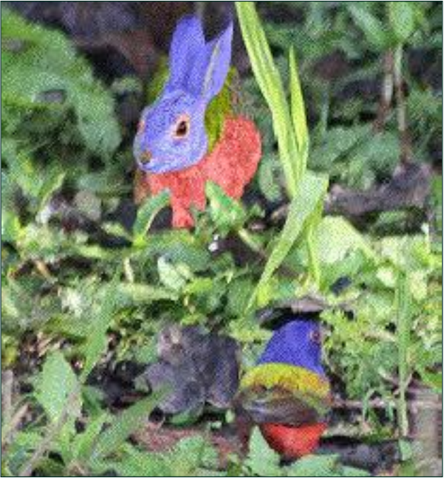
The rare and elusive Painted Bunting emerges at dusk from a thicket to forage near a Painted Bunting, left.