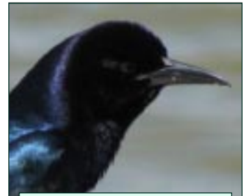
Boat-tailed Grackle dark eye