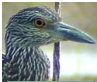
Yellow-crowned Night Heron imm: lower bill black