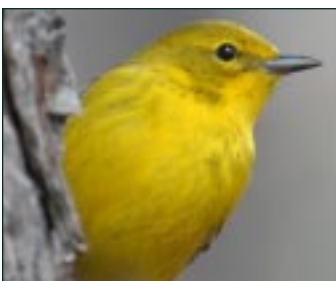
Pine Warbler gray on head, eye ring