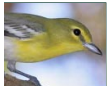
Yellow-throated Vireo dark band from bill to eye