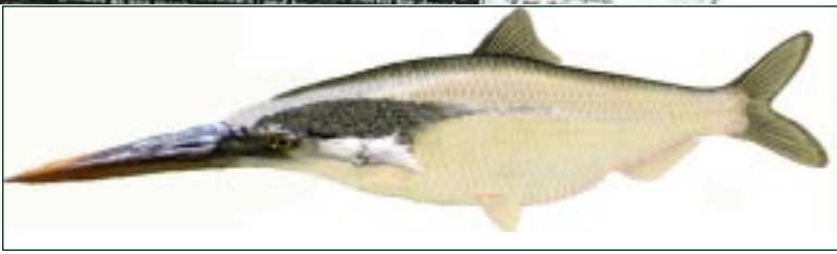
The fabled Corkscrew Great Blue Herring, above.