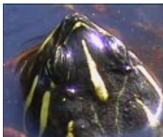
Red-bellied Turtle no stripes over eye