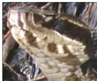
Water Moccasin brown blotches on chin