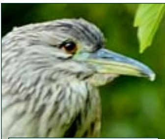
Black-crowned Night Heron imm: lower bill yellow