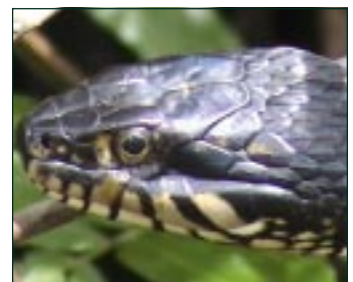
Banded Water Snake fine black lines on chin