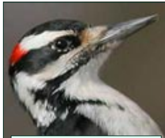
Hairy Woodpecker bill longer than head width