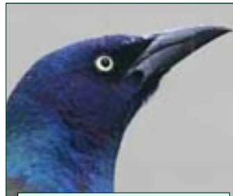
Common Grackle white eye