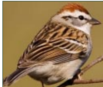
Chipping Sparrow white over eye, underneath