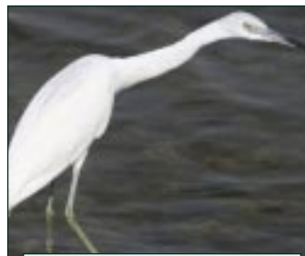
Little Blue Heron, imm. two-tone bill, green legs/feet