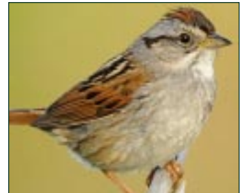
Swamp Sparrow gray over eye, underneath