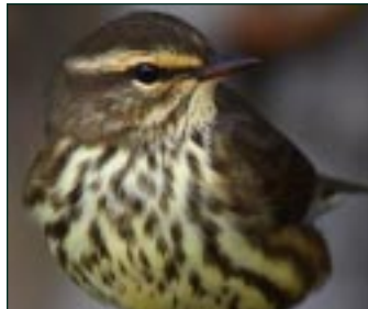
Northern Waterthrush stripes into throat, tail bobs