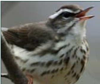
Louisiana Waterthrush clear throat, tail sways