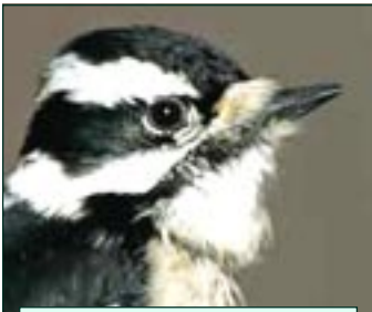
Downy Woodpecker bill shorter than head width