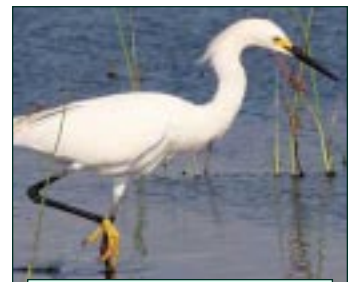
Snowy Egret black bill & legs, yellow feet