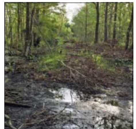
The Bird Rookery Swamp trail presented challenges prior to clearing.

And gradually, treasures connecting, word to word and step to step, the Flint Pen trail began to sing her song.