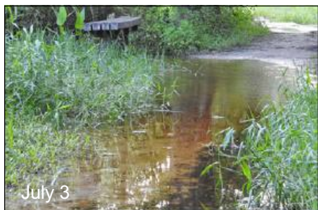
Bird Rookery Swamp, near Ida's Pond