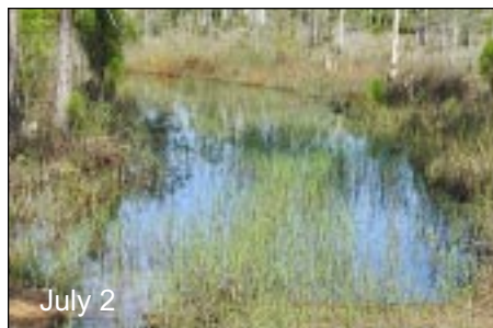
Flint Pen Strand, from Vincent Road